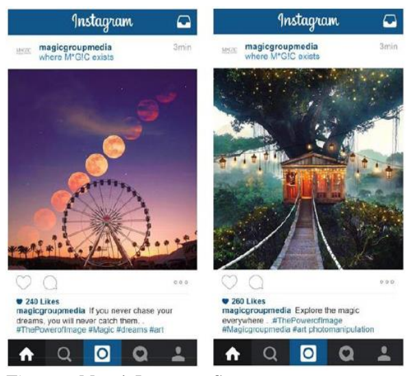
Figure 4. Magic's Instagram Strategy

It is good for Magic to also portrait their brand value on their Instagram account by starting to create and post simple creative images, instead of only posting the works Magic has done for clients. They don't have to be really complicated compositing images, but the images should be presented in high quality compositing, fun, creative and inspiring.