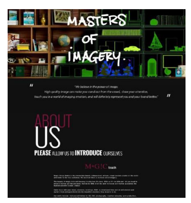
Figure 7. Magic's Website Strategy