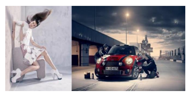
Figure 2. Magic Group Media's works

As a post-production company with a very good reputation and many loyal clients, in order to constantly keeps growing and expand the business to a wider market, Magic needs more new potential clients. Magic has done some promotional strategies which work well with the existing clients: partaking in some industry events, the occasional party, the occasional paid promotion, and direct presentations to clients.