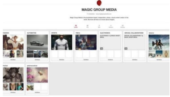
Figure 5. Magic's Pinterest