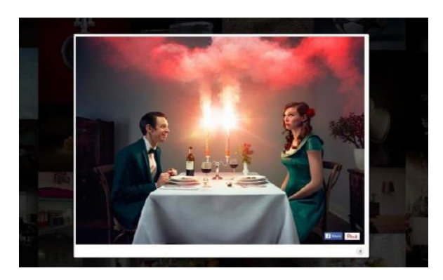
Figure 8. Magic's Website Strategy