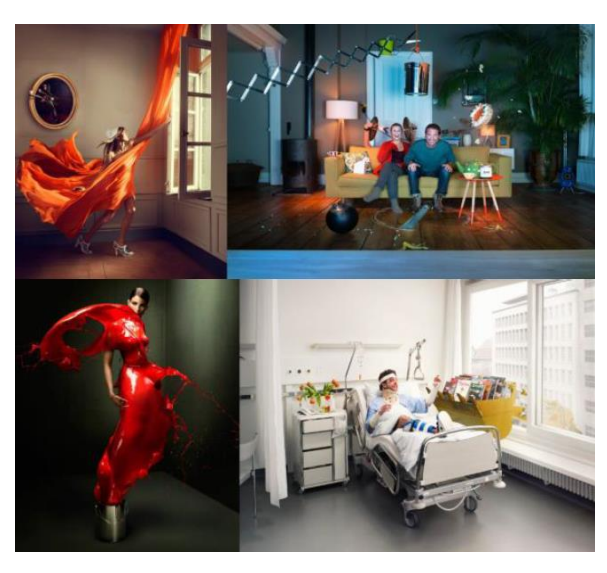
Figure 1. Magic Group Media's works

Here are some examples of Magic's works: